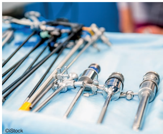
Surgery and endoscopy instruments

Ugitech, Swiss Steel Group, benefits from an experienced worldwide commercial presence thanks to its international sales network.